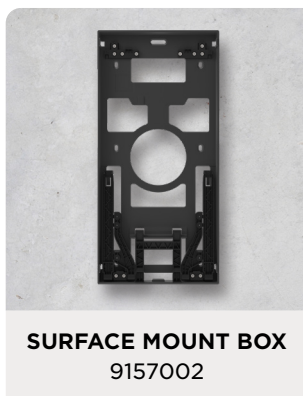
SURFACE MOUNT BOX 9157002

Intercom dimensions with the surface-mounting installation box