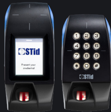
Available in touchscreen or keypad versions