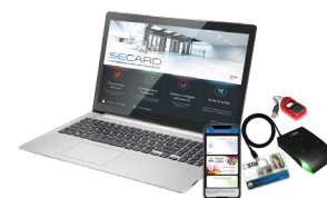
SECARD SECard configuration kit and SSCP® v1 & v2 and OSDP™ protocols

**Caution: information about the distance of communication: measured from the center of the antenna, depending on the type of credential, size of the credential, operating environment of the reader, temperatures, power supply voltage and reading functions (secure reading). External interference may reduce reading distances. Legal: STid, Architect® and SSCP® are registered trademarks of STid SAS. All trademarks mentioned in this document belong to their respective owners. All rights reserved – This document is the property of STid. STid reserves the right to make changes to this document and to cease marketing its products and services at any time and without notice. Photos are not contractually binding.