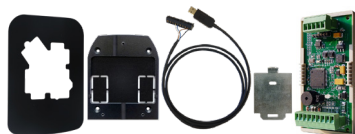
Decorative plate / Spacer / Converter cables / Mounting plate...