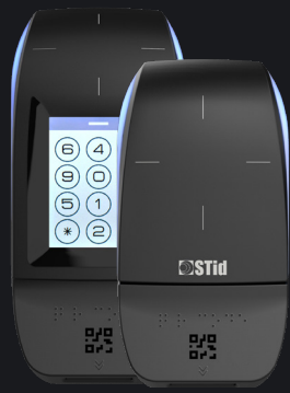
Available in standard or touchscreen versions