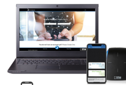
STid Mobile ID® Online Portal Web platform for remote management of your virtual cards