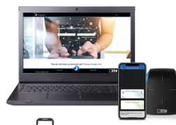
STid Mobile ID® Online Portal Web platform for remote management of your virtual cards (users and configuration)