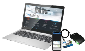
SECARD SECard configuration kit