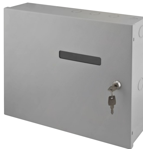
Set of cables included