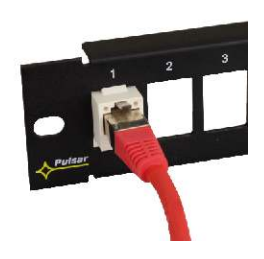
Keystone RJ45 connector