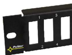
Patch panel RAP-SCAPC2