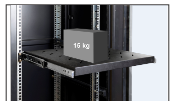
shelf loading capacity